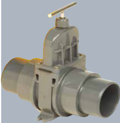
PVC inlet sluice valve DN 100 or DN 150, with pipe sockets bonded in, for the time-saving and space-saving direct connection to the inlet clamping flange.